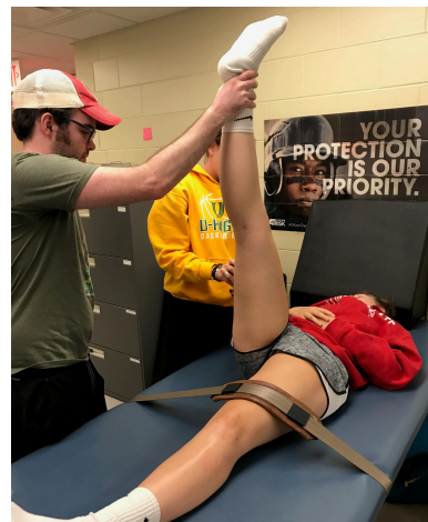
Figure 3. Hip Flexion PROM

Hip flexion ROM was measured with the participant in a supine position. A strap was applied firmly across the contralateral distal thigh to assure minimal pelvic movement. 38 With the knee fully extended, the participant actively flexed the hip to its maximal range with instructions to stop when the knee started to bend or when the participant felt as though they could not move any further. A clinician placed the digital inclinometer at the midpoint on the lateral thigh between the greater trochanter and the lateral femoral condyle. 38 The research assistant recorded the degree of the reading on the digital inclinometer. The participant then returned to the same starting position (supine, knee extended) and the clinician passively flexed the hip to a point in which a firm end feel was felt. 38 The degree on the digital inclinometer was recorded.