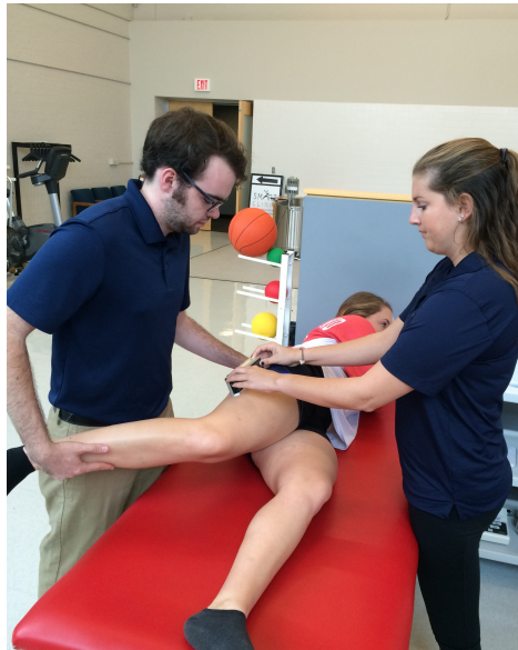
Figure 1. Ober's test

The participant then underwent baseline ROM measurements performed by the research assistant in a counterbalanced order. Before each measurement, the digital inclinometer was zeroed on a vertical surface. Knee flexion ROM was measured with the participant in a supine position. The clinician placed a digital inclinometer on the mid-shaft of the tibia. The participant was asked to maximally flex the knee actively. The research assistant recorded the degree of this angle. With the participant in the same starting position and the inclinometer in the same location, the research assistant then passively flexed the knee until the first soft end point was felt. A research assistant recorded the degree of this angle.